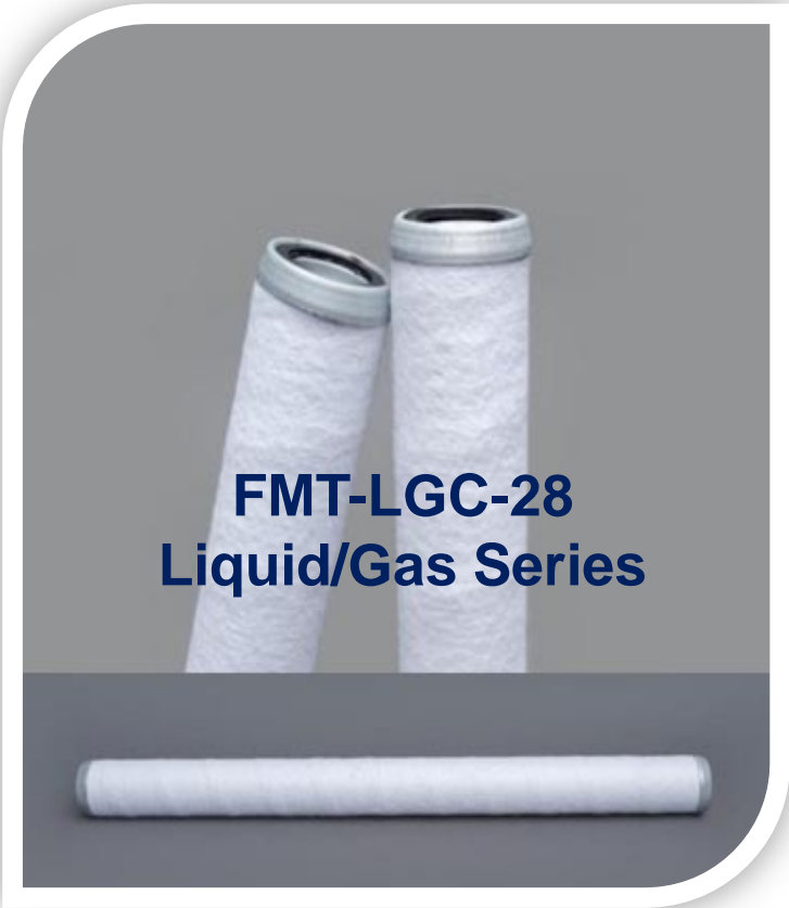
FMT-LGC-28 Liquid/Gas Series